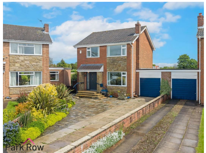
To the front of the property there is a paved driveway with space for parking, a stone paved area with further space for parking, steps up to the entrance door, a pathway which leads to the rear garden, access into the garage, an area filled with mature bushes and shrubs and a perimeter dwarf wall to the right hand side.