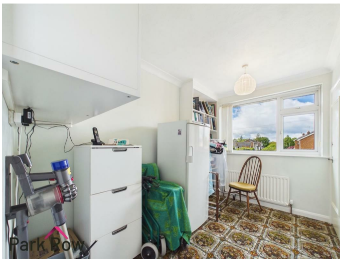
A double glazed window to the front elevation, a central heating radiator, a door which leads into a storage cupboard and a cupboard door that leads into over-stairs storage.