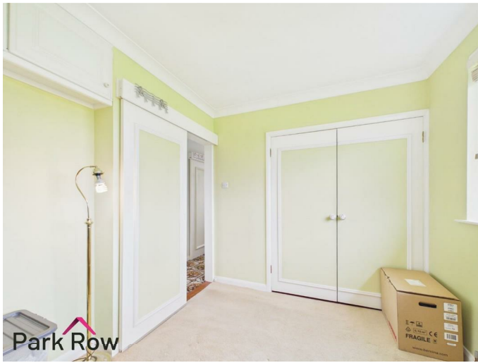
BEDROOM THREE 10'8" x 6'11" (3.27 x 2.11)