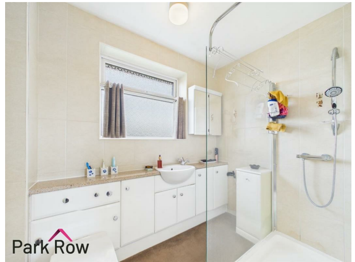
An obscure double glazed window to the rear elevation and includes; a close coupled w/c and a hand basin set within the same white wooden unit with space for storage and a roll-edge laminate worktop over, a fully tiled walk in mains shower with a glass shower screen, a chrome heated towel rail and is fully tiled floor to ceiling.